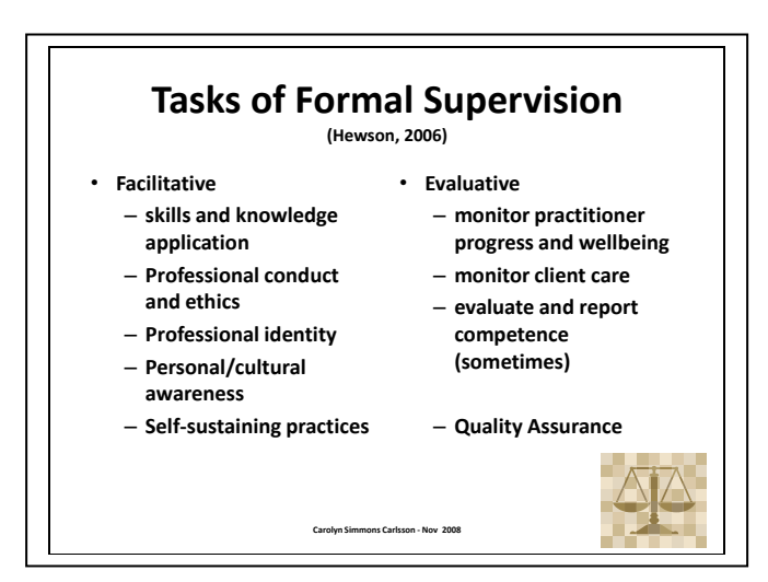
Figure 1. Tasks of formal supervision

Taken at face value, there is a mismatch between what the Code of Ethics (2004) states about supervision and what the HPCAA states (2003). Apart from misconstruing that 'peer review' and 'supervision' are one and the same, the Code of Ethics refers to a developmental process involving reflection and dialogue which facilitates professional growth, whilst attending to professional accountability. The HPCAA refers to the task of monitoring performance and reporting on said performance. Whilst the latter may be an intrinsic process in supervision, it is a highly narrow portrayal of supervision and fits better with performance management systems. Although commensurate with the process of 'competence assurance', the HPCAA meaning of supervision takes into account only one aspect of supervision; the task of evaluative supervision (Figure 1.).